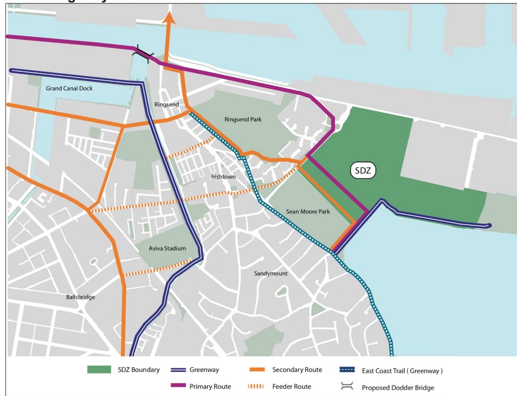
Extract of Poolbeg SDZ Written Statement

As this route is off-road via "The Drain" beside a badly lit park and shared with pedestrians, we would like to see